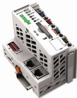
750-831 Daikin WAGO BACnet/IP Controller